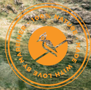
GREEN LAKE, STYRIA, AUSTRIA