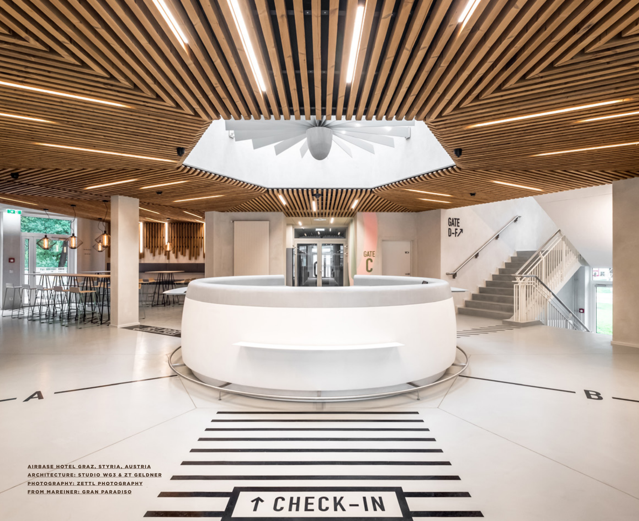
AIRBASE HOTEL GRAZ, STYRIA, AUSTRIA ARCHITECTURE: STUDIO WG3 & ZT GELDNER PHOTOGRAPHY: ZETTL PHOTOGRAPHY FROM MAREINER: GRAN PARADISO