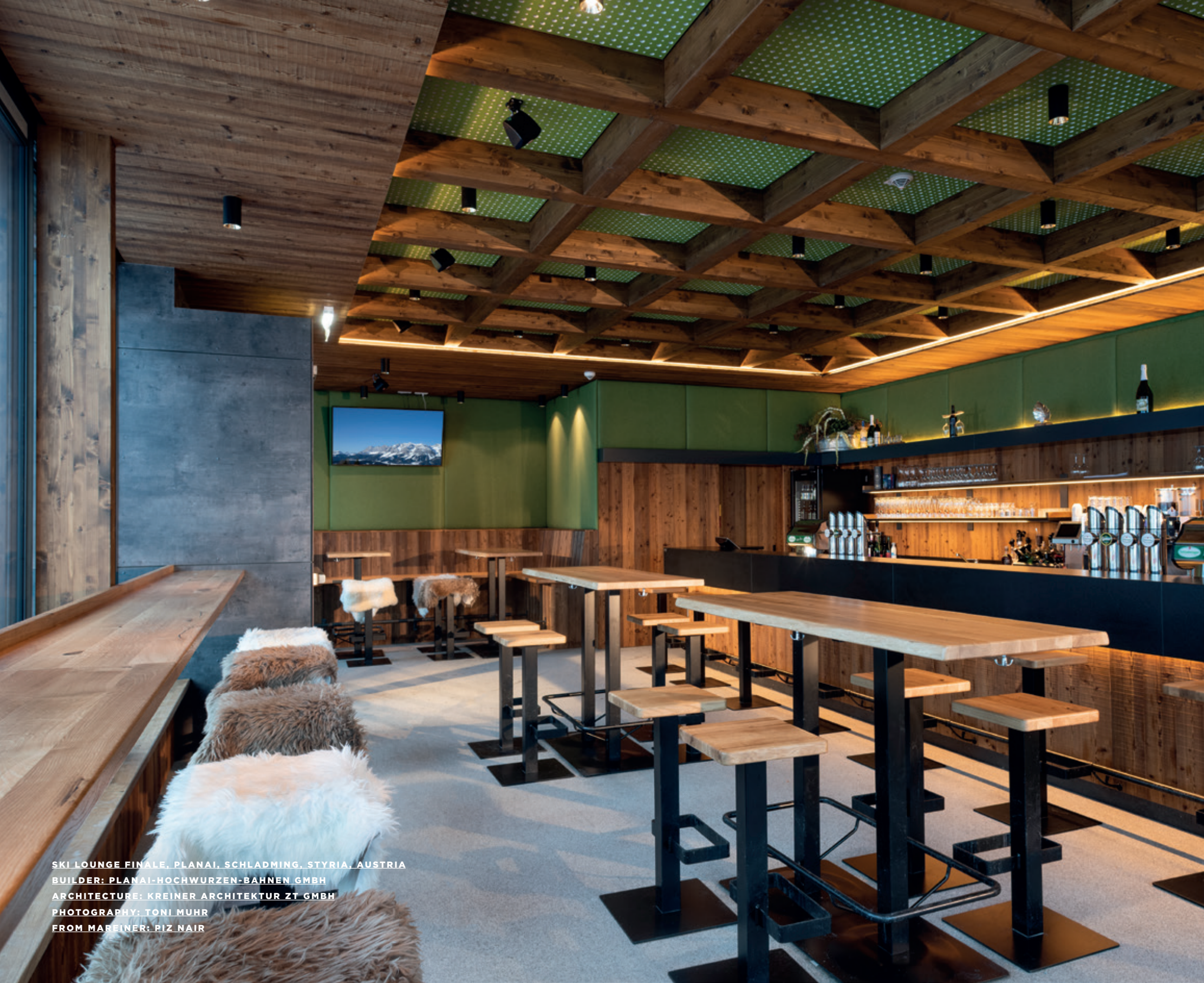
SKI LOUNGE FINALE, PLANAI, SCHLADMING, STYRIA, AUSTRIA BUILDER: PLANAI-HOCHWURZEN-BAHNEN GMBH ARCHITECTURE: KREINER ARCHITEKTUR ZT GMBH FROM MAREINER: PIZ NAIR